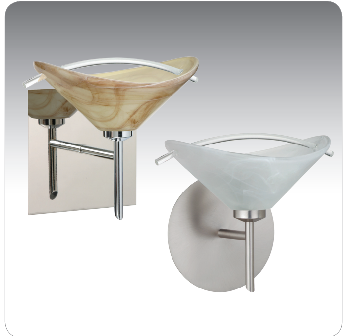
HOPPI SHOWN IN MOCHA/CLEAR (181305) WITH SQUARE CANOPY IN CHROME FINISH & MARBLE/CLEAR (181304)

UL or ETL Listed. Suitable for Damp Locations (interior use only).