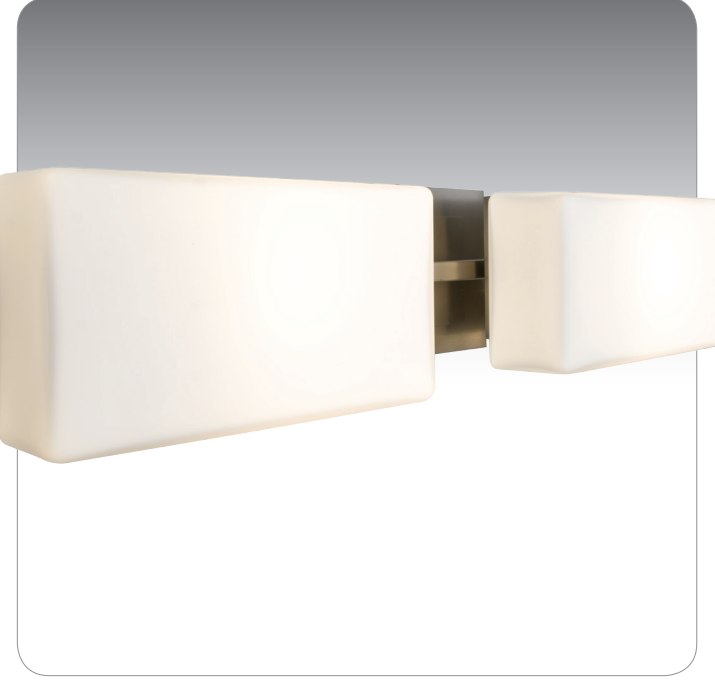
LIDO SHOWN IN OPAL MATTE (888607)