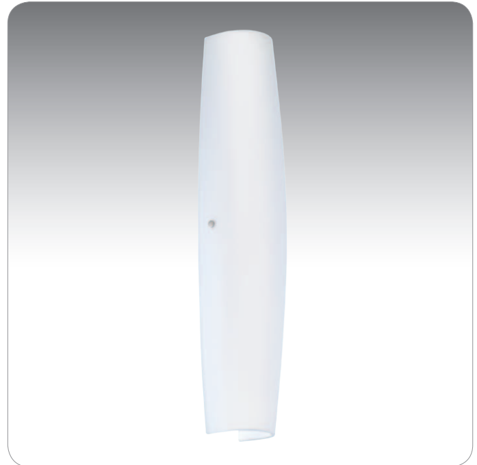
MISTRAL SHOWN IN OPAL MATTE (711207)