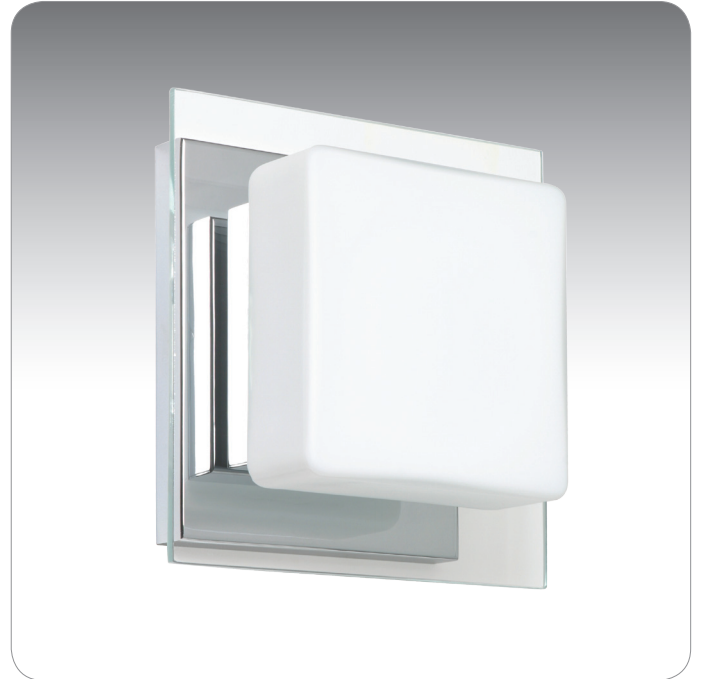
ALEX SHOWN IN OPAL/CLEAR (773539)

UL or ETL Listed. Suitable for Damp Locations (interior use only).